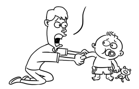
In making a trust nomination, I give away all rights and benefits under my policy to my nominee(s).

Please? I did not realise... You own all the benefits under the insurance policy now!