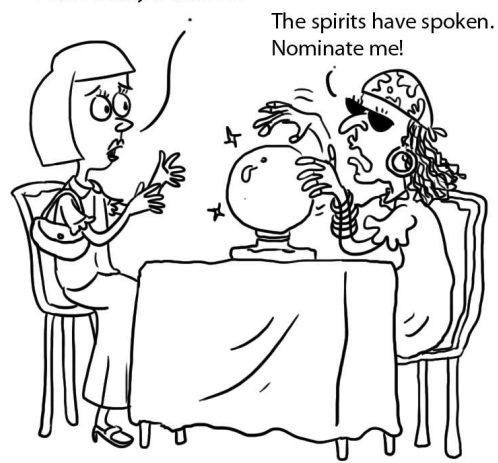
I want to be sure the moneys from my policy are paid to the person(s) I wish to benefit, at the right time and in the right amount(s).