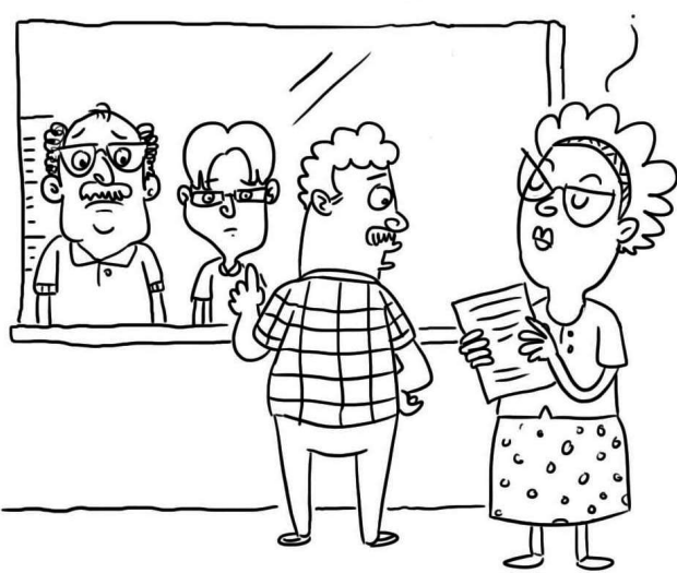
To revoke (i.e. undo) a trust nomination, I need the consent of a trustee other than myself, or of every nominee.

Before you can get their consent in writing, can you identify all your current nominees?